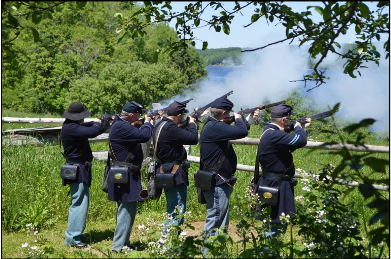
Co. I, 20 th Maine in action at Kings Landing.